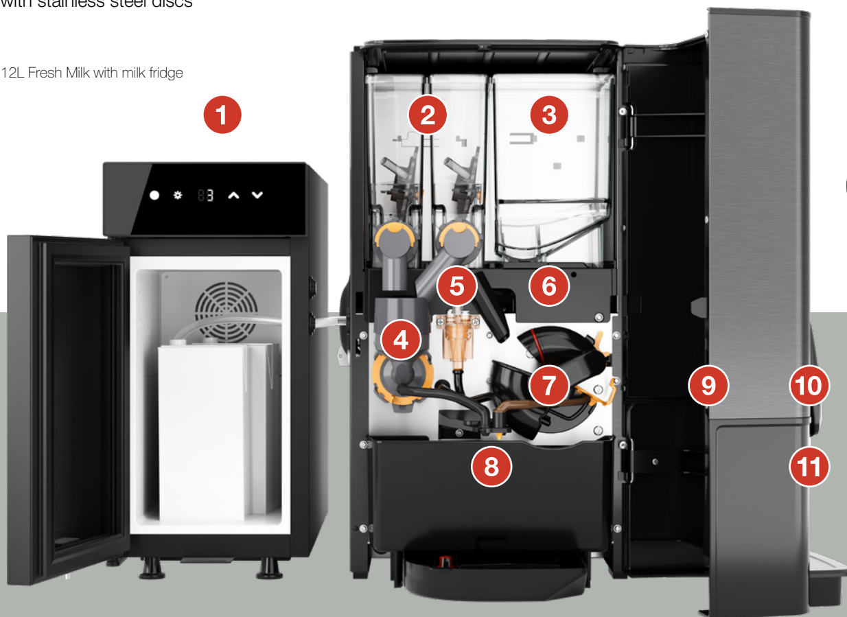
Sego 12L Fresh Milk with milk fridge